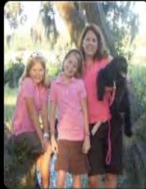
beautiful girls 48 photos