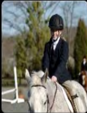
Horseshow 12 photos