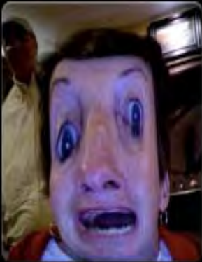
zany photos 28 photos