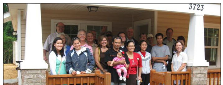
Dedication of the Habitat House completed in 2011