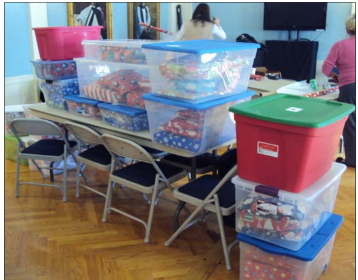
The Duff wrapping and packing volunteers perform their Santa's magic early each December