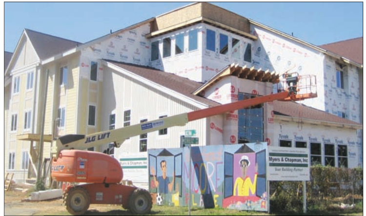
Construction is almost complete at Moore Place, a long-term support facility to assist the chronically homeless towards stability and getting back into homes of their own.

In conjunction with a local non-profit, Trips for Kids, Christ Church is collecting ‘Dusty, not Rusty’ bikes. We will accept all kinds of bikes: child, adult, mountain, road, etc. Your donation will help enable our 5th graders at Rama Road Elementary to continue their fun mountain bike rides at Colonel Beatty Park with Trips for Kids. We would like to collect all bikes on Saturday January 7th at the Church. If you have a bike that you would like to donate, please contact Burch Mixon at burchmixon@carolina.rr.com .