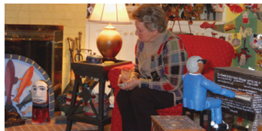
Admiring the folk art collection during a recent L.E.G.S. gathering